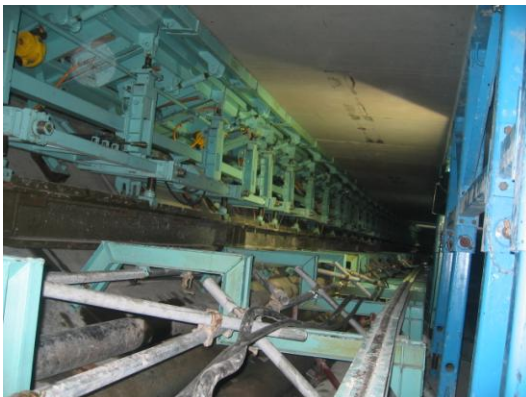
TBM Construction Box Interface

Analysis of detailed alternative methods of construction and layouts within agreed budget and design and supervision of White Tank Construction methods using single pass linings and resin injection technologies.