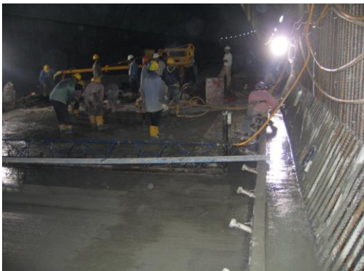
Minimising Costs with WT Injection Techniques