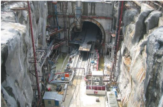
Alternative Methods of Construction

SMART Flood Relief and Motorway Tunnel Kuala Lumpur, Malaysia Risk Analysis and Design of Watertight Construction